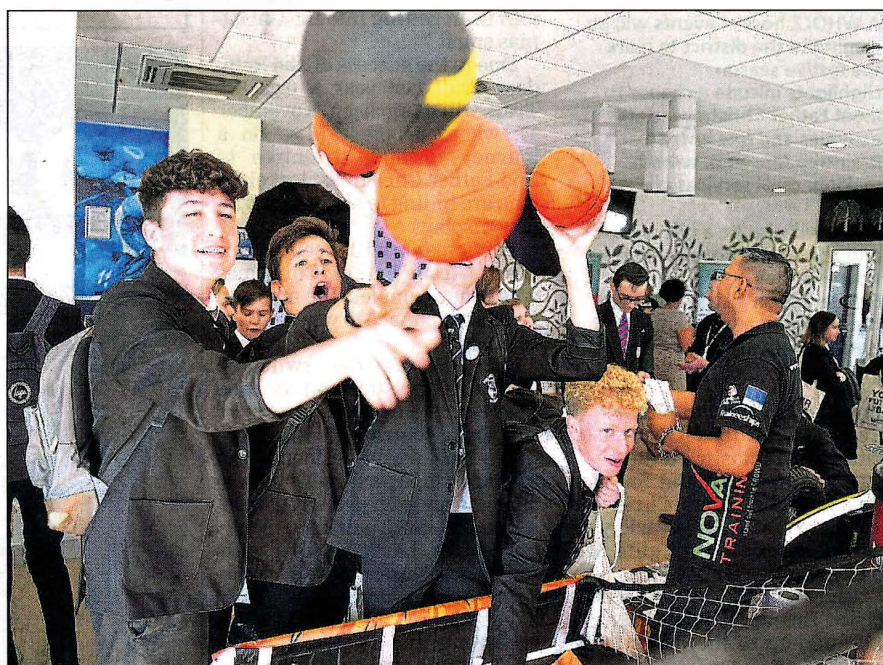
SHOOTING HOOPS: Hedingham School pupils play basketball