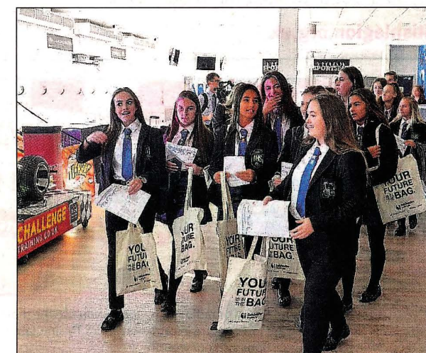
JOBS FAIR: Pupils take a look around the stalls