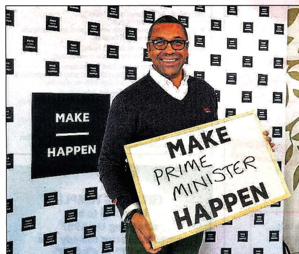
GOOD FUTURE: James Cleverley MP